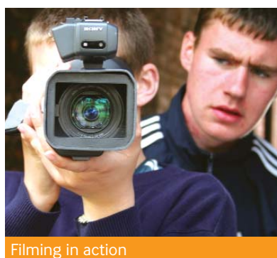
Filming in action

Theatre production 'Cap-a-Pie' worked with around 20 children and young people who are looked after to create their film "That's Entertainment". The scriptwriter spent time talking to the youngsters to understand the situations teenagers found themselves in and to define the issues.