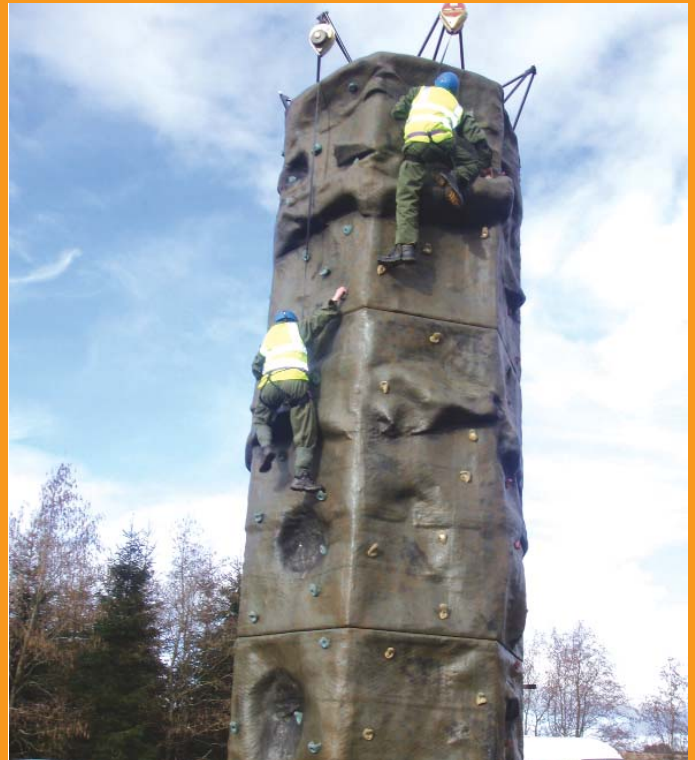
Otterburn Climbing Wall

On the 18th February 2006 at 5:30 in the morning, a group of 20 young people from North East YOTs travelled up to Otterburn to experience the first of six-days (spread over 3 weekends) designed to give them a taste of Army life, whilst improving their team building skills and self-esteem. Two of the group were young people from Sunderland Intensive Support & Supervision Project (ISSP) and went on to be two of only five to complete the whole course.