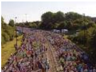
The Great North Run