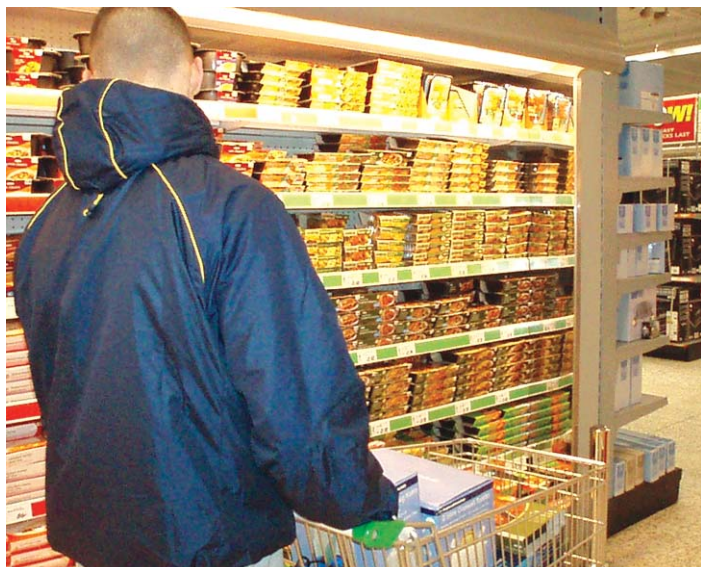
Young person learning to live independently

The YOS works closely with young offenders upon leaving custody to support re-integration and the Sunderland Rehabilitation and Aftercare Programme (RAP) provides for some of the most complex, disengaged and at risk young offenders released from custody. It is aimed at those with substance misuse problems and/or dual diagnosis mental health issues, but there are often other significant issues including homelessness, lifestyle and motivation issues. The intensity, voluntary and alternative nature of the scheme has worked for some young offenders where all else has failed.