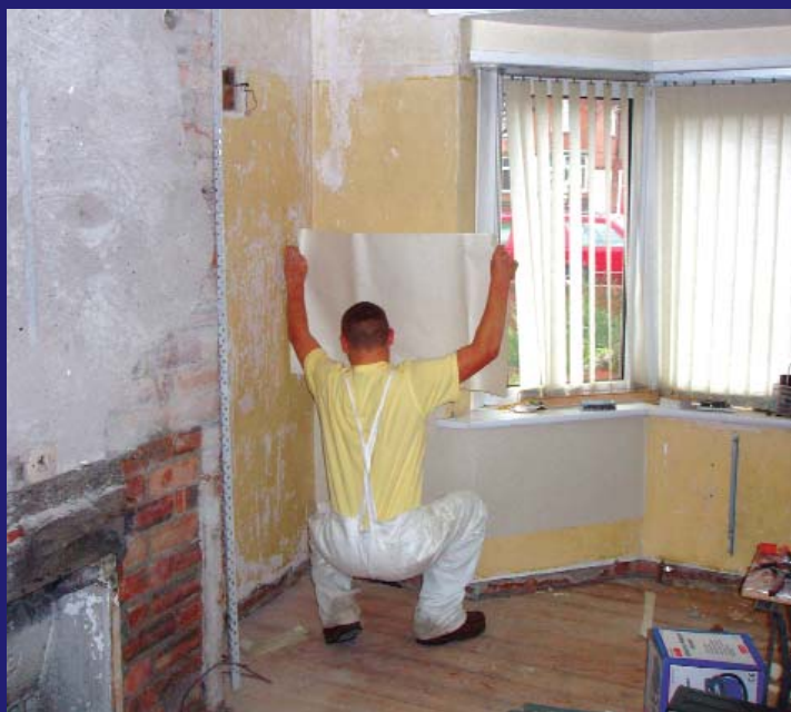
Young person wallpapering

Over the last seven months, youths on the Intensive Supervision and Surveillance Programme (ISSP) have been part of a project, aimed at developing skills for employment whilst simultaneously helping a local family. The young offenders decorated a house in Jarrow that was in need of major internal cosmetic work. This involved them stripping, repapering and painting walls, and painting ceilings, doors, doorframes and skirting boards. The house was completed to a first class standard!