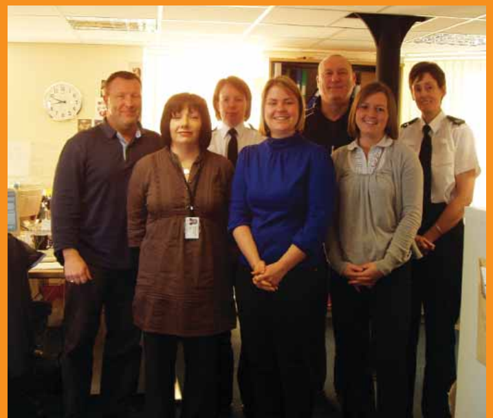
The Restorative Justice Team

Restorative Justice team were also highly commended. The team have made a significant impact on work with victims and the effective use of direct and indirect reparation.