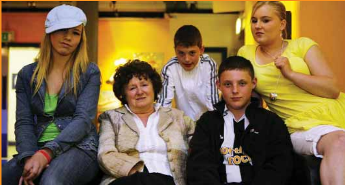
Young people with Baroness Andrews OBE

A group of 10 young people from Washington and Sunderland, who work with two of Sunderland YOS Prevention Services, have been working with Tyne & Wear Museums and Superkrush Films to create two fascinating and thought-provoking films about the issues of substance use. The films premiered at Sunderland University in July 2007.