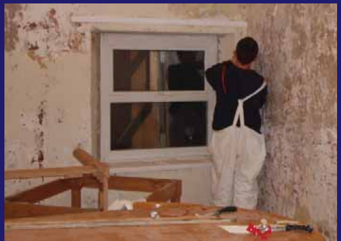
Young offender decorating one of the Lodge's 8 rooms