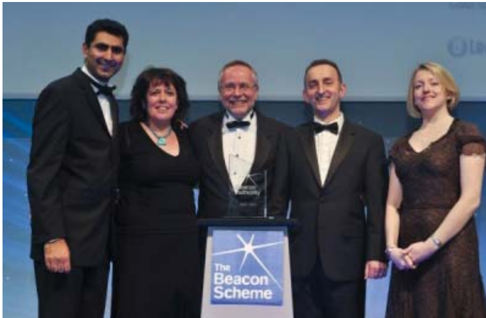
YOS with Beacon officials