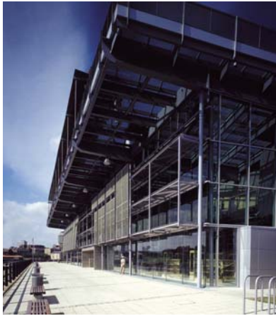
National Glass Centre